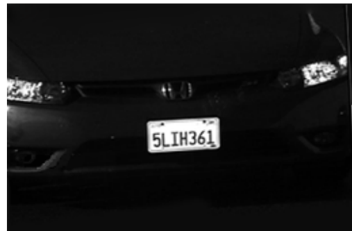
Image capture comparison without Ambient Rejection Technology (left) and with (right)